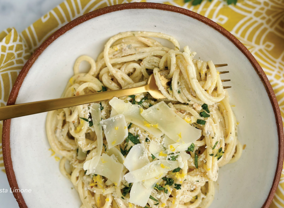
Whitefish Pasta Limone